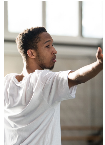
National Youth Dance Company