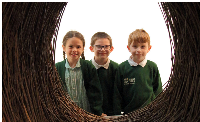
Turner Contemporary photo Caroline Bray

Learn more about how Arts Award can work for you in museum and heritage settings at artsaward.org.uk/museums