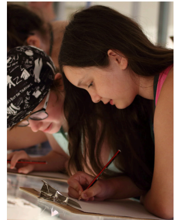
Zoology Museum Cambridge